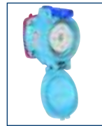
Existing 63-64043 receptacle

The plug with voltage rotation meter assembly should be ordered to match the receptacles to be tested.