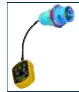
Matching plug with voltage phase rotation meter assembly 63-61043-MTR