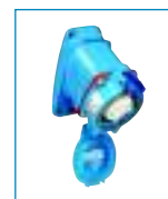
Female Receptacle with Angle Adapter 09-P4070 + 01-NA027