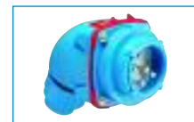
Male Inlet with Handle (Plug) 09-P8070 + 01-NA313

A typical order should include an inlet part number, a receptacle part number AND the matching handles, angles or other required accessories.