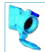
Female Receptacle with Angle Adapter 63-04340 + 61-6A027