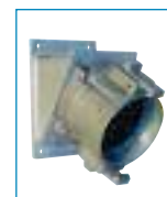
Female Receptacle with Angle Adapter 37-04320-SS + MA3SS