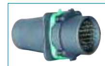
Male Inlet with Handle (Plug) 37-08320-SS + 3H1SS

A typical order should include an inlet part number, a receptacle part number AND the matching handles, angles or other required accessories.