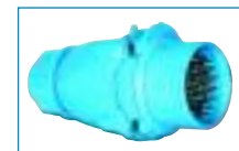
Male Inlet with Handle (Plug) 63-08340 + 61-6A013

A typical order should include an inlet part number, a receptacle part number AND the matching handles, angles or other required accessories.