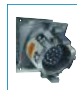
Female Receptacle with Angle Adapter 37-04130-SS + MA2SS