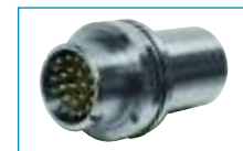
Male Inlet with Handle (Plug) 37-08130-SS + 1H1SS

A typical order should include an inlet part number, a receptacle part number AND the matching handles, angles or other required accessories.