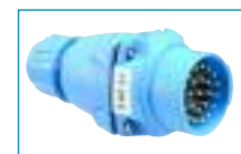
Male Inlet with Handle (Plug) 63-08220 + 61-3A013

A typical order should include an inlet part number, a receptacle part number AND the matching handles, angles or other required accessories.