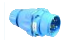
Male Inlet with Handle (Plug) 33-38540 + FH611

A typical order should include an inlet part number, a receptacle part number AND the matching handles, angles or other required accessories.