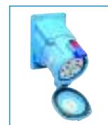
Female Receptacle with Angle Adapter 33-34540 + MP6